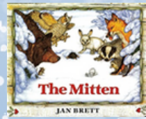
The Mitten by Jan Brett