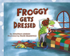
Froggy Gets Dressed by Jonathan London