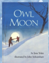
Owl Moon by Jane Yolen

We are very grateful to the First Congregational Church for their generous support of our office space.