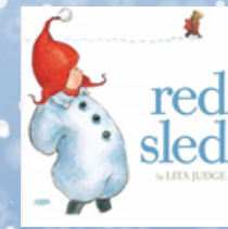
Red Sled by Lita Judge