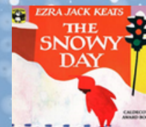
The Snowy Day by Ezra Jack Keats