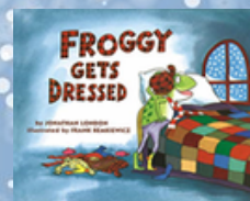
Froggy Gets Dressed by Jonathan London