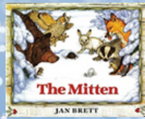
The Mitten by Jan Brett