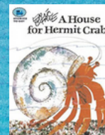
A House for Hermit Crab By Eric Carle