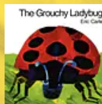
The Grouchy Ladybug by Eric Carle