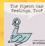
The Pigeon Has Feelings, Too! By Mo Willems