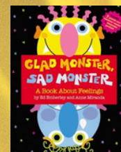
Glad Monster, Sad Monster By Ed Emberley