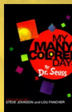
My Many Colored Days By Dr. Seuss