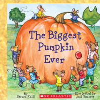
The Biggest Pumpkin Ever by Steven Kroll