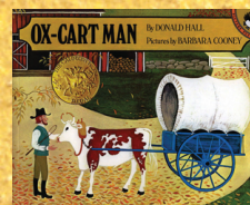
Ox-Cart Man by Donald Hall