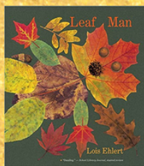
Leaf Man by Lois Elhert