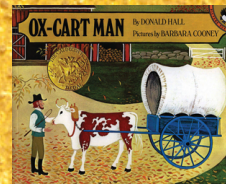
Ox-Cart Man by Donald Hall