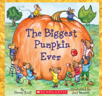
The Biggest Pumpkin Ever by Steven Kroll