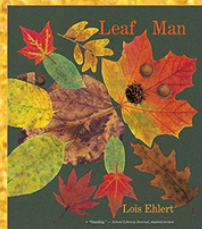
Leaf Man by Lois Elhert